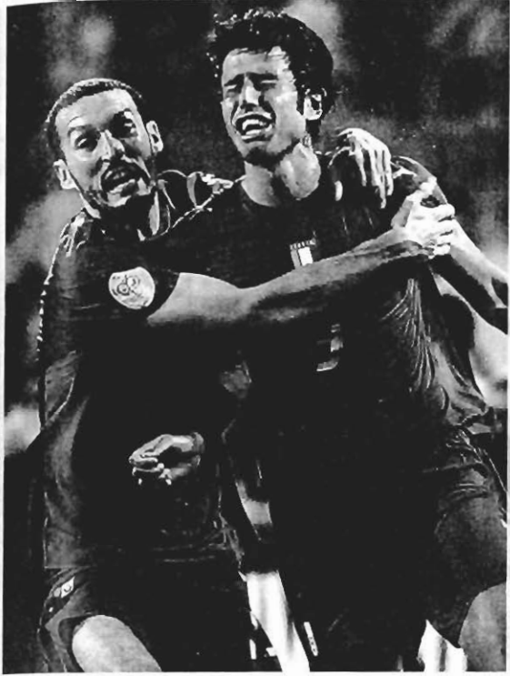
They want to cheer after the final as well: Gianluca Zambrotta (left) and Fabio Grosso.